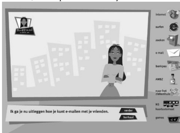
Figure 3. Screen shot of Steffie

Steffie is a screen agent designed in Flash and developed as a part of a website (www.steffie.nl) where she features as a talking guide, explaining the internet, e-mail, health insurance, cash dispensers and railway ticket machines.