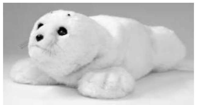
FIGURE 1. Paro

In the study we present here, we wanted to establish (1) the acceptability of alternative robots by dementia patients, therapists and care personnel, (2) a possible influence of experience with robotic pets or the above mentioned alternatives and (3) the differences and agreements between preferences for pet robots of caregivers and dementia patients.