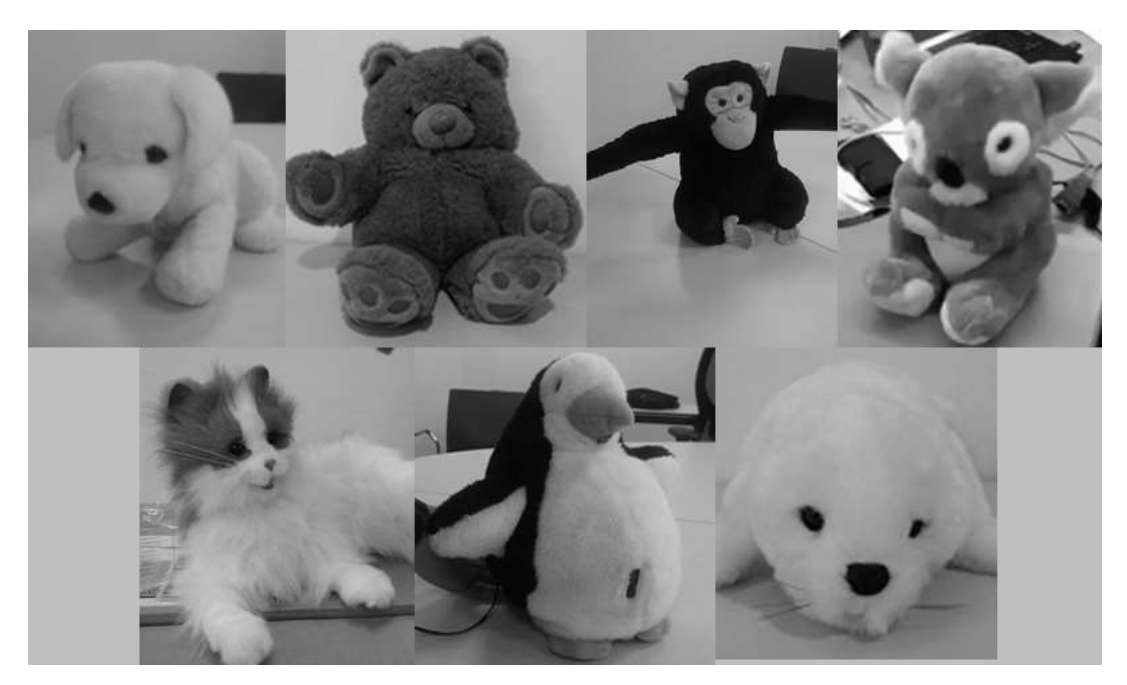
FIGURE 2. Available robotic pets

To enable us to answer the first three questions we noted the reactions of people with dementia to seven different robotic animal s; a dog, a cat, a teddy bear, a seal, a monkey, a penguin and a koala bear. Not only did we observe the reactions to the animals when they did not move or make a sound (when they were switched off) but also when they did move and make sounds. The animals were all of a similar size, approximately 30 centimeters long and all were able to move their arms and heads when touched. When doing this they also made a soft squeaking sound adapted to the natural sound of that type of animal.