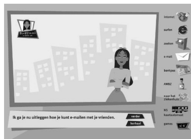
Figure 3. Screen agent Steffie

Steffie is a screen agent designed in Flash and developed as a part of a website (www.steffie.nl) where she features as a talking guide, explaining the internet, e-mail, health insurance, cash dispensers and railway ticket machines.